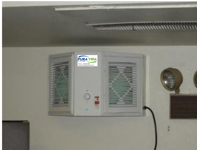
2006D&L, Filter, UV Shield and Catalyst

The Pura Vida Air Systems 2006D&L is a stand-alone unit used to reduce the levels of Volatile Organic Compounds (VOCs) and viable airborne biological contaminants. The unit is utilized as a “point-of-use” air purifier. The 2006D&L uses two 2” catalyst panels and two 2” MERV 13 filters. A 1” UV shield is attached to the catalyst to protect the user from UV light. The D&L may be wall mounted or set on a surface. This unit is suitable for spaces up to 2700 ft 3 . For recommended unit configurations, contact Pura Vida Air Systems. All Pura Vida Air Systems products incorporate 3-step P technology: MERV Filtration, UVGI Lamps and Photocatalysis.